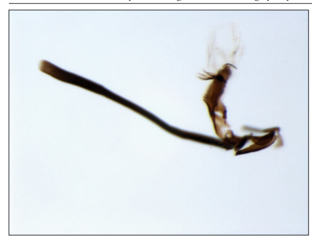
Fig. 2. Male genitalia structure C. nigra (Ztt.)