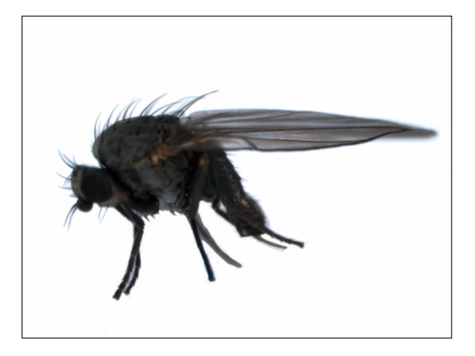
Fig. 3. Imago of Chromatomyia nigra (Ztt.)