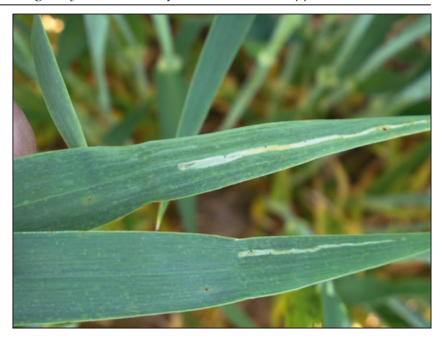
Fig. 4. Winter wheat leaves damaged by larval stage of C. fuscula