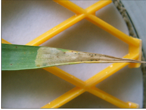
Fig. 5. Winter wheat leaf damaged by larval stage of P. superciliosa

6. Based on the research and literature data, the species composition of Agromyzidae damaging winter wheat in particular years varies.